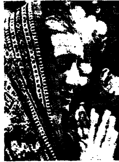
Indira Gandhi... 'not even Gandhi or Nehru had such authority.'

NEW DELHI (APNS). — With the landslide victories of the Congress Party in the elections to the Legislative Assemblies, India is now a one-party state in which virtually total power belongs to a single person, Mrs. Indira Gandhi.